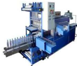
GROUP SHRINK MACHINE