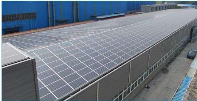
Our Humble Beginning