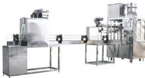
BOTTLE FILLING MACHINE