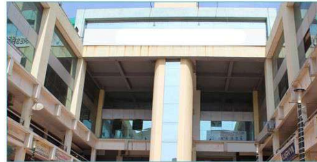
City Corporate Office