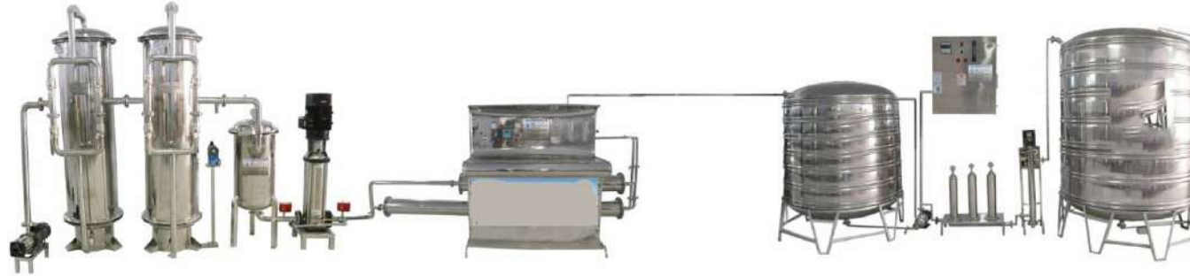
MINERAL WATER PLANT