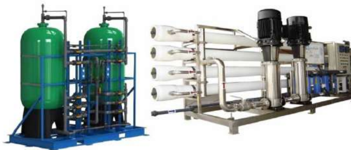
INDUSTRIAL RO PLANT